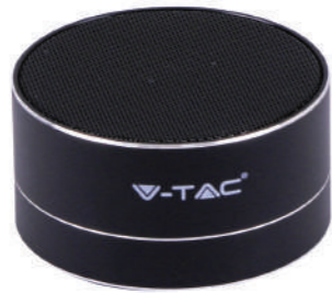
VT-6133 SKU: 7712